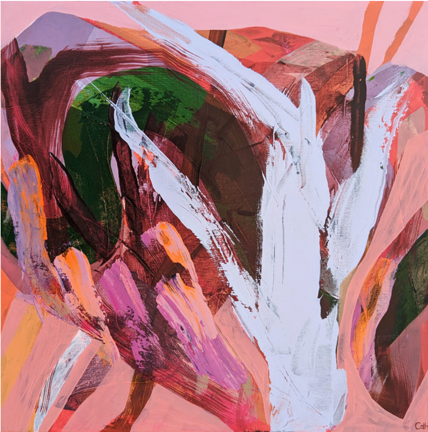
Chris de Hoog The River , 2023 Acrylic on canvas 50cm x 50cm Framed in raw oak $990