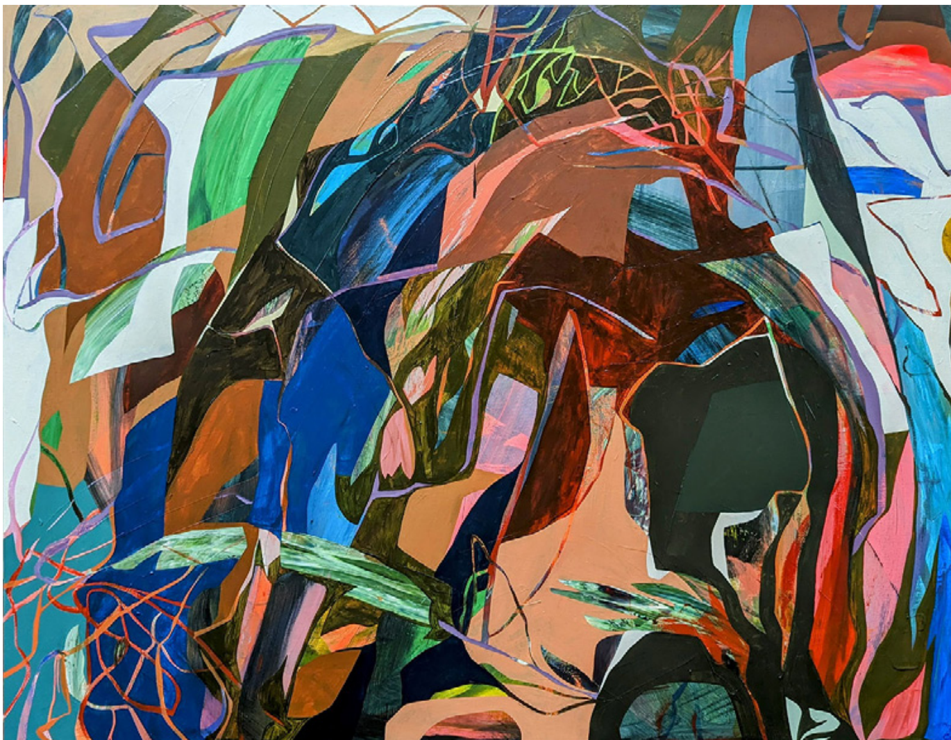
Chris de Hoog Tangled Heart , 2023 Acrylic on canvas 150cm x 120cm Framed in raw oak $3190