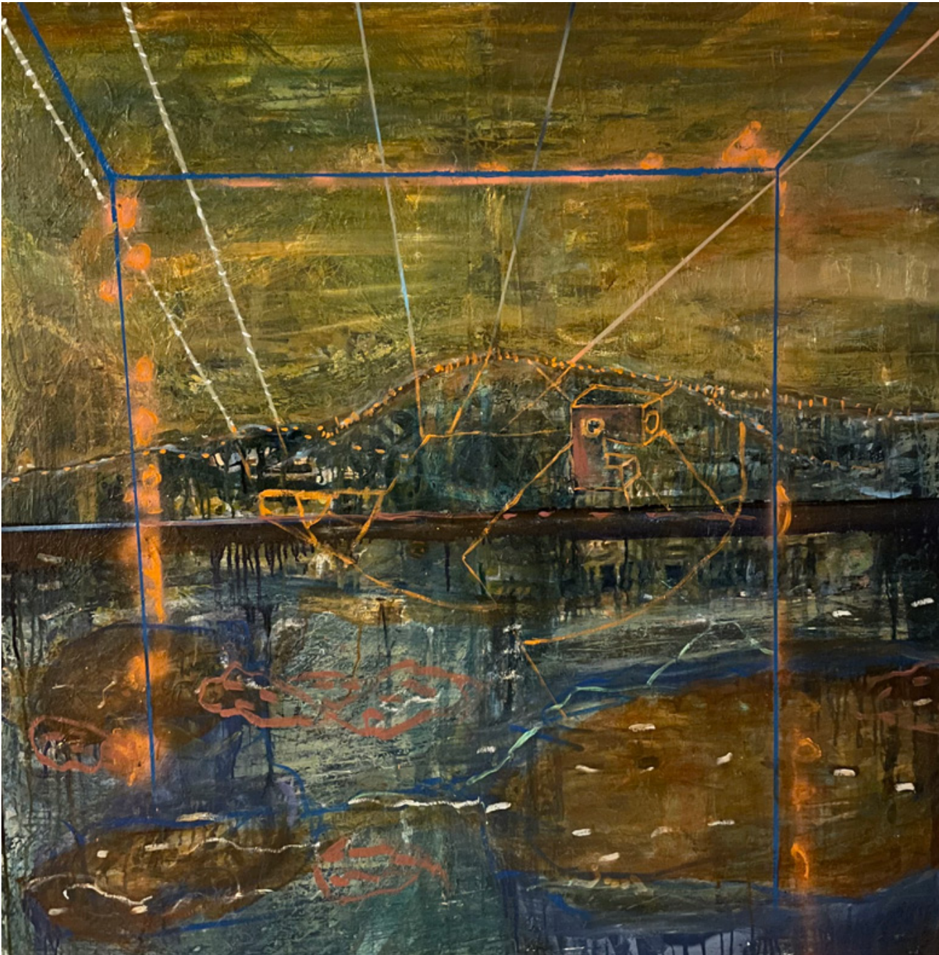
Nathan Feldman All Hope is Lost , 2023 Oil on canvas 120cm x 120cm Framed in raw oak $3125