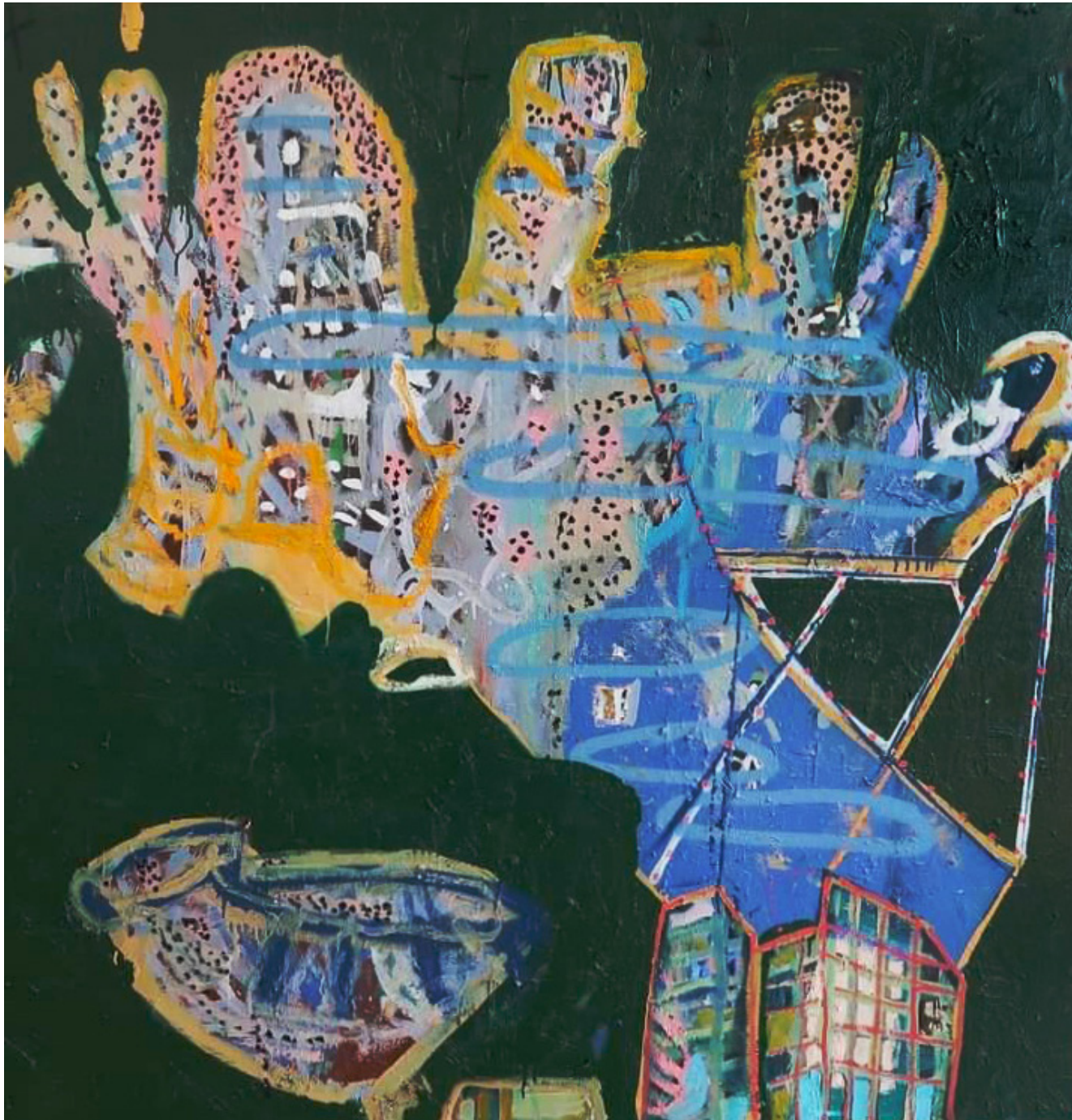
Nathan Feldman Hope in Green , 2023 Oil on canvas 150cm x 150cm Framed in raw oak $4600