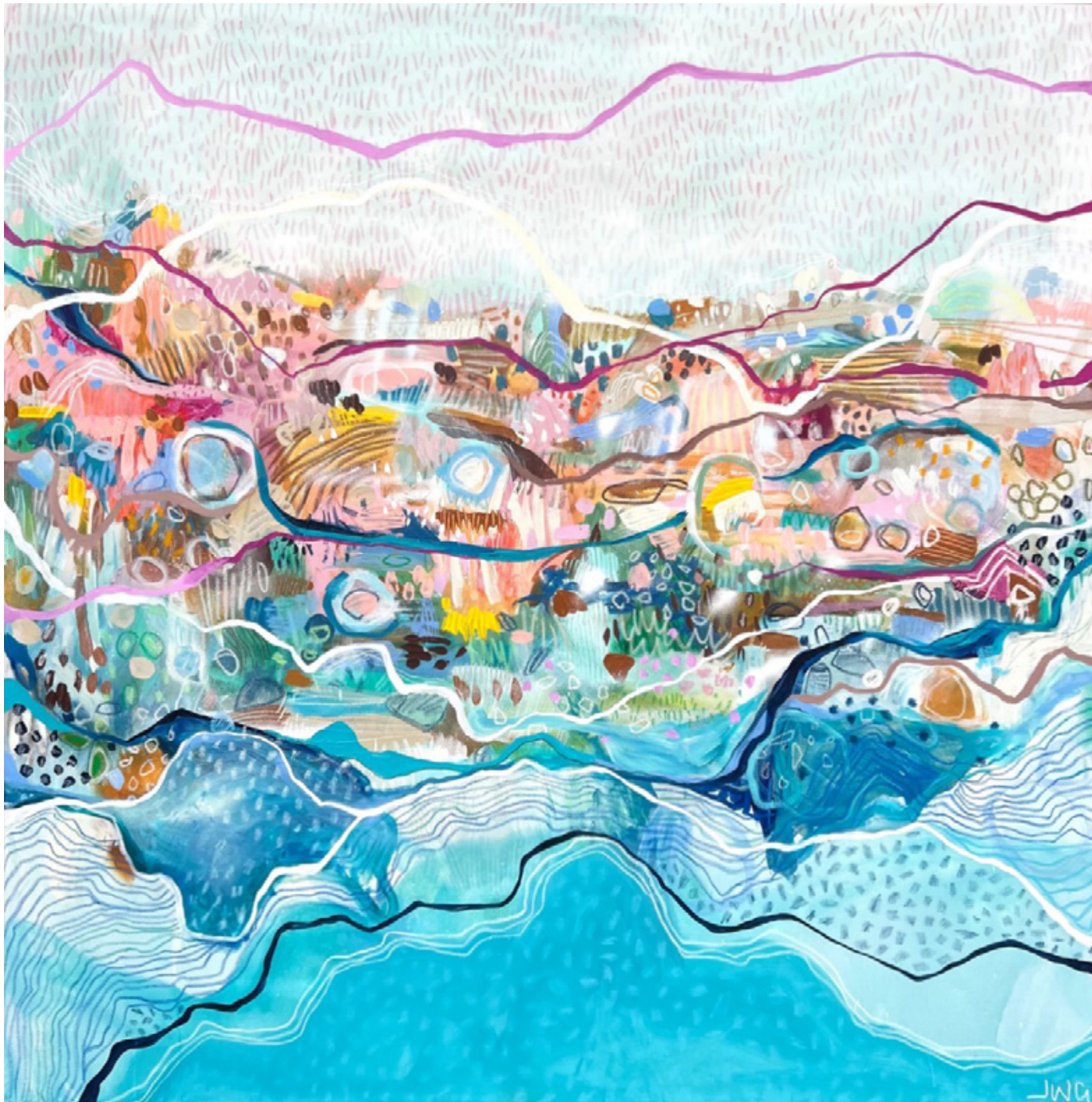
Jonathan Gemmell Valley Stream, 2023 Acrylic on canvas 120cm x 120cm Framed in raw oak $2900