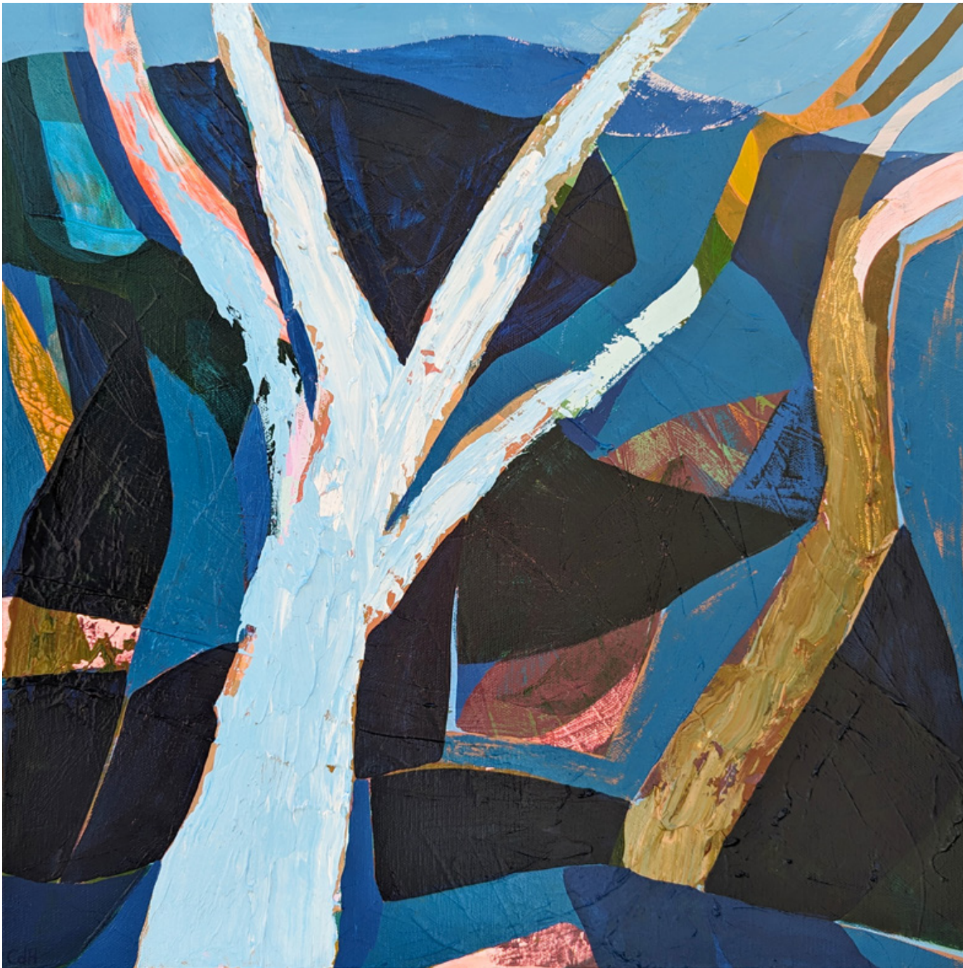
Chris de Hoog Ground Cover, 2023 Acrylic on canvas 50cm x 50cm Framed in raw oak $990