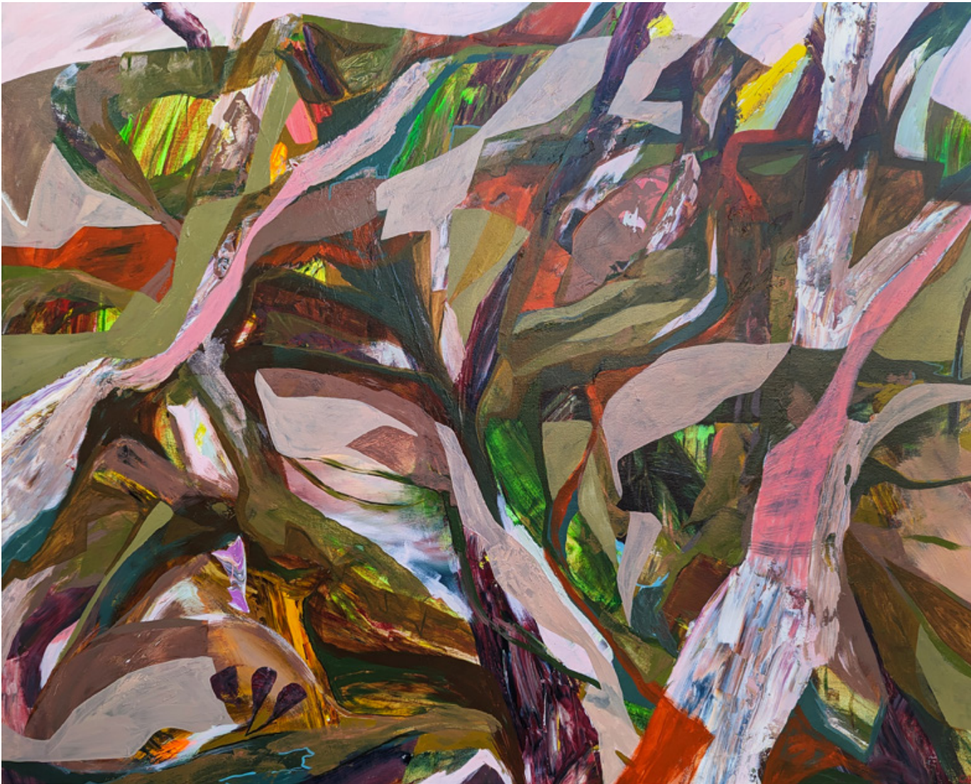
Chris de Hoog Beyond the Horizon , 2023 Acrylic on canvas 150cm x 120cm Framed in raw oak $3190