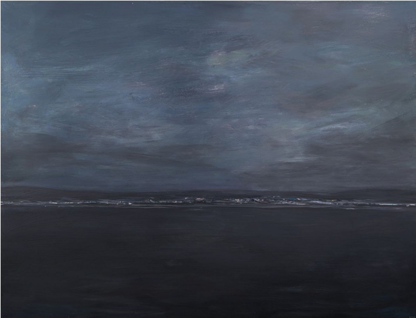
Amie de Hoog New Year's Eve, 2023 Acrylic on board 105cm x 80cm Framed in charcoal oak $1590