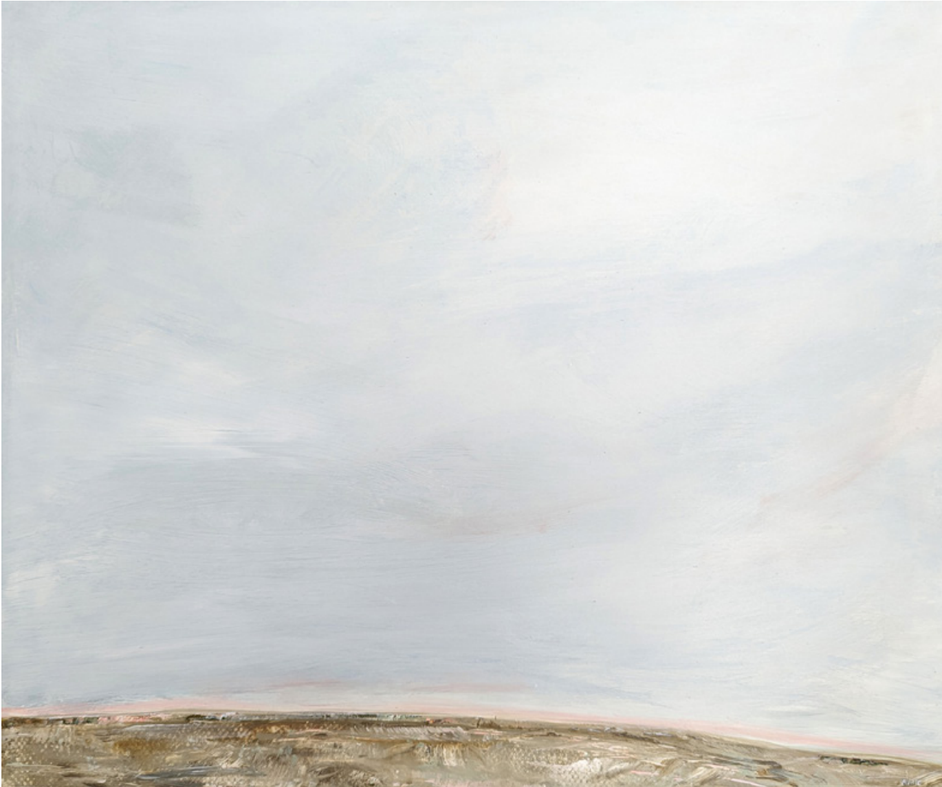
Amie de Hoog Just Beyond , 2023 Acrylic on board 60cm x 50cm Framed in charcoal oak $890