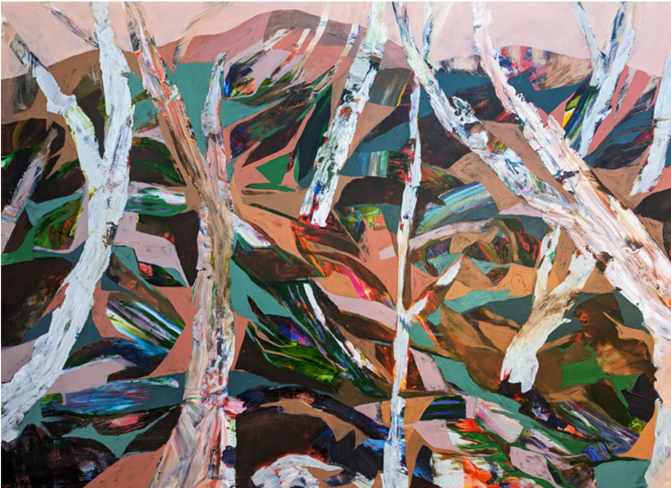
Chris de Hoog The Great Dance , 2023 Acrylic on canvas 198cm x 143cm Framed in raw oak $4990