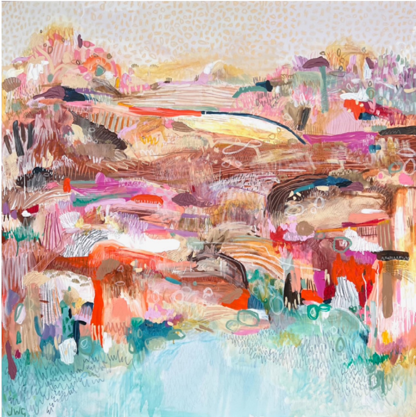
Jonathan Gemmell By the Billabong, 2023 Acrylic on canvas 150cm x 150cm Framed in raw oak $4900